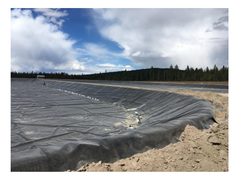
Figure 4: Looking northeast at both lagoons. Note that they are both completely lined.