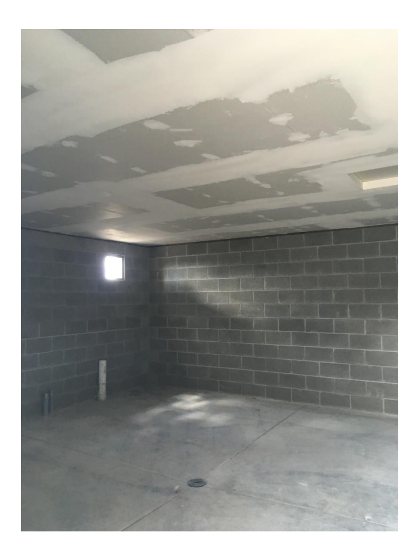
Figure 7: Looking inside the chlorinator building at the completed ceiling.