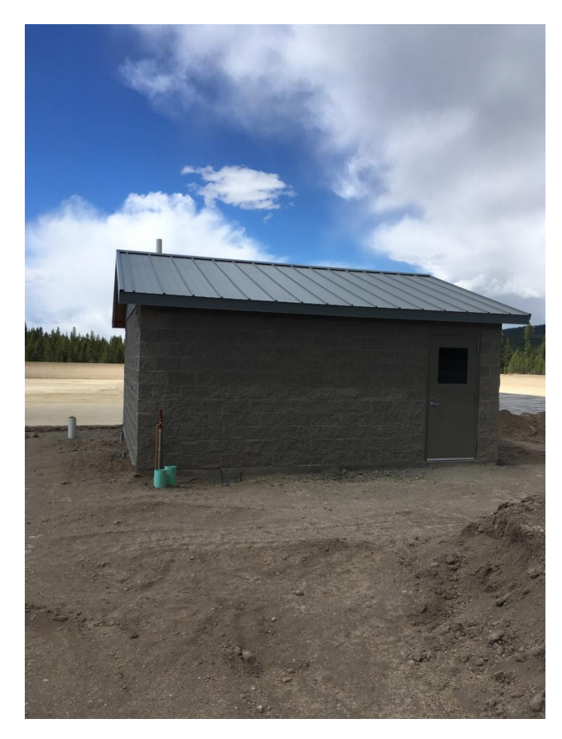
Figure 6: Looking north at the completed roof on the chlorinator building.