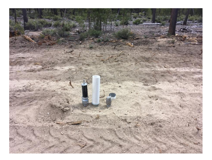
Figure 3: Looking south at the stub out of the irrigation mainline. Note the clean out.