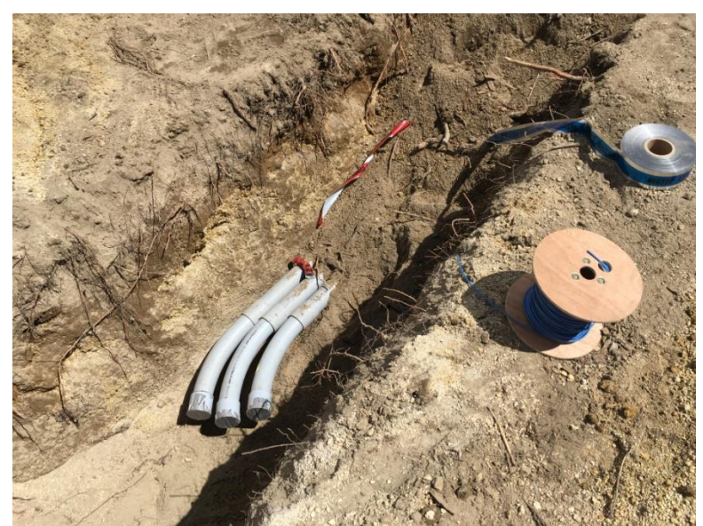
Figure 1: Trench with the electrical conduits waiting for connection. This image is on the east side of the gasline crossing.