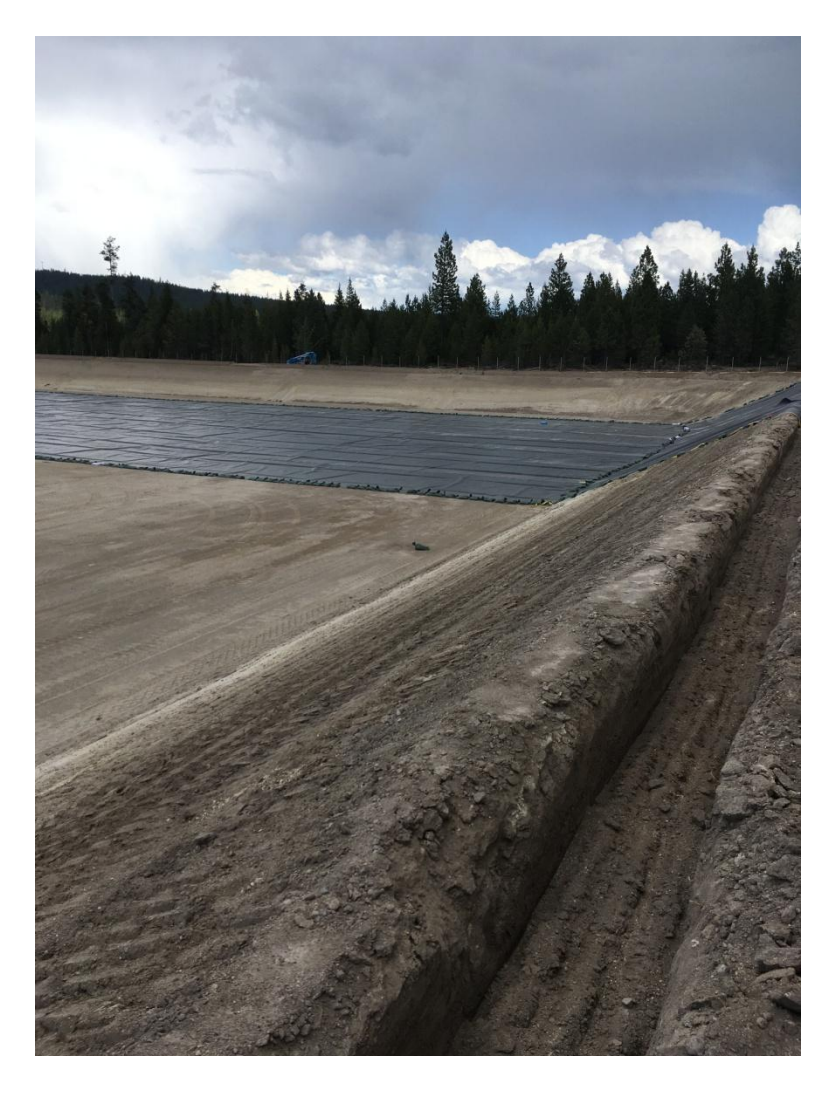
Figure 8: Looking east at the start of lining operations for the storage pond.