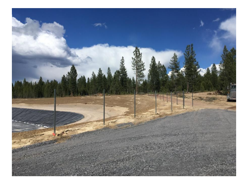
Figure 9: Looking north at the newly graveled entrance road and fence poles running the perimeter of the facility.