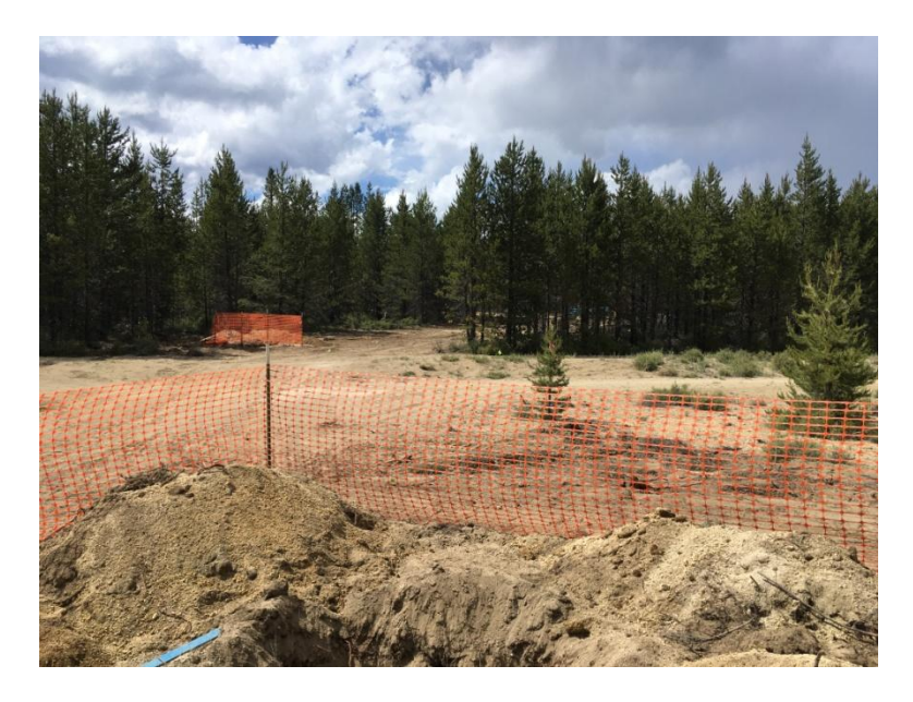
Figure 2: Looking west from the east side of the gasline crossing trench, to the mirrored trench on the west.