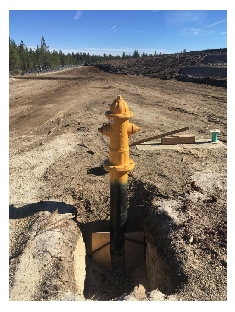
Figure 5: The installed fire hydrant to be used for dust suppression by the fire service.