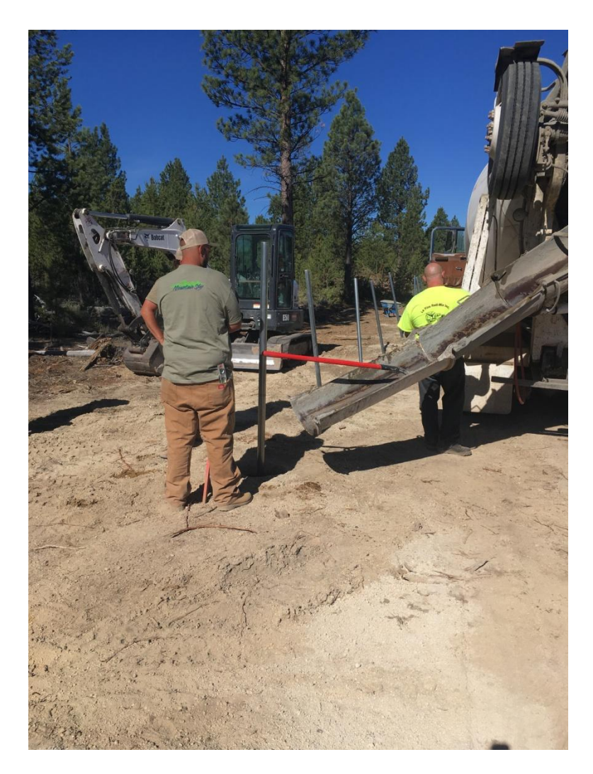
Figure 6: Image of fence posting being cemented into place.