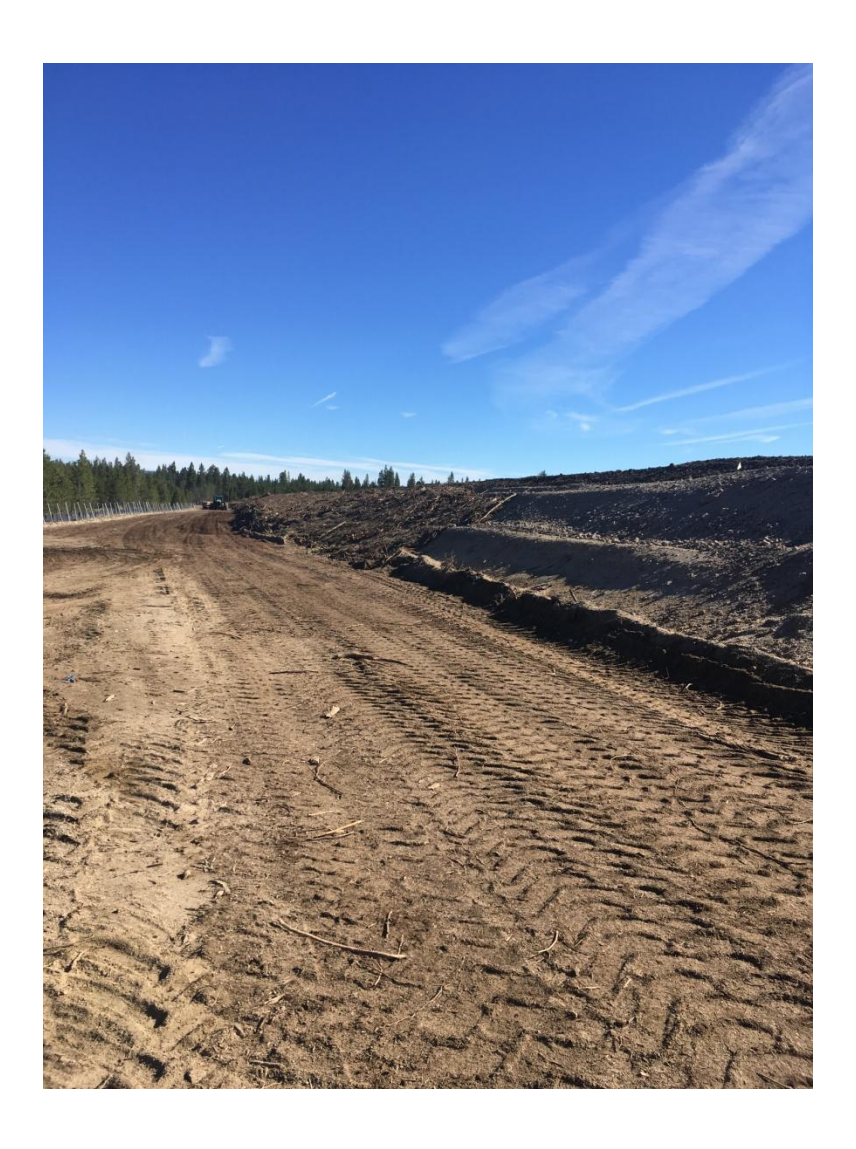
Figure 4: Looking north at the western-most berm along the storage pond. Note that amouring has been completed on the northern slope, to about half way through the picture with material stacked and waiting for amouring to be complete.