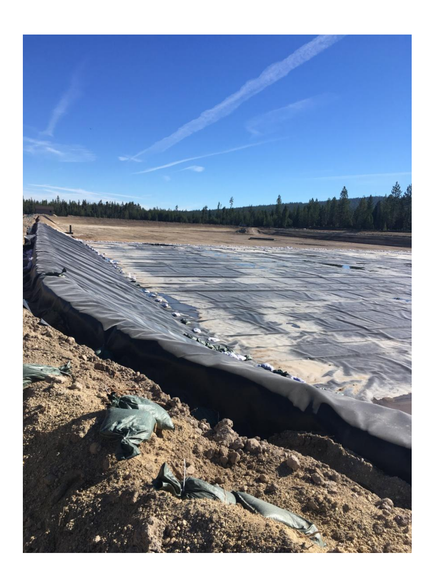
Figure 1: Looking north at the eastern lagoon and the progress of liner installation. Note the sand bags throughout the liner necessary to secure it in place.