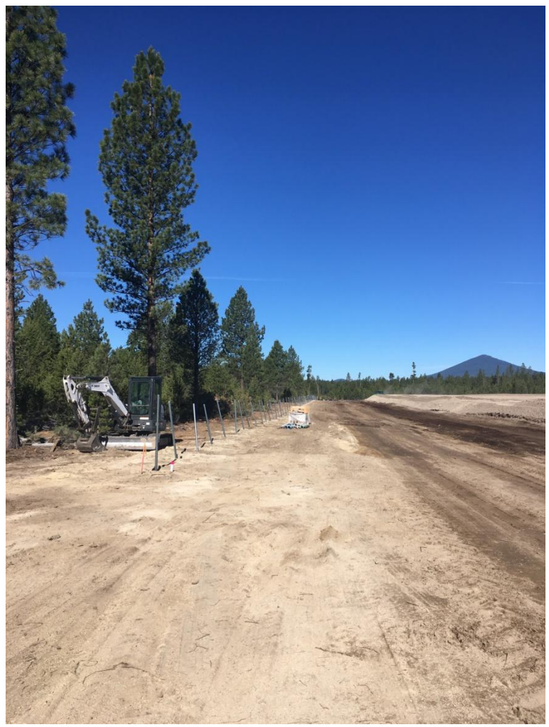
Figure 3: Looking west at the placement of fence poles for the cyclone fence that will run the perimeter of the facility.