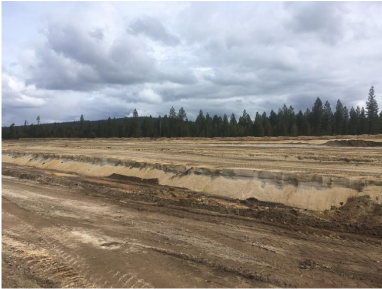
Figure 6: Looking east at the overall project. Note that this picture shows what will be the eastern facultative lagoon.