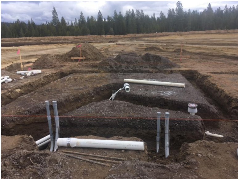
Figure 2: Looking east at the dug out foundation pad for the chlorination building with preinstalled conduits for sewage and electrical work.