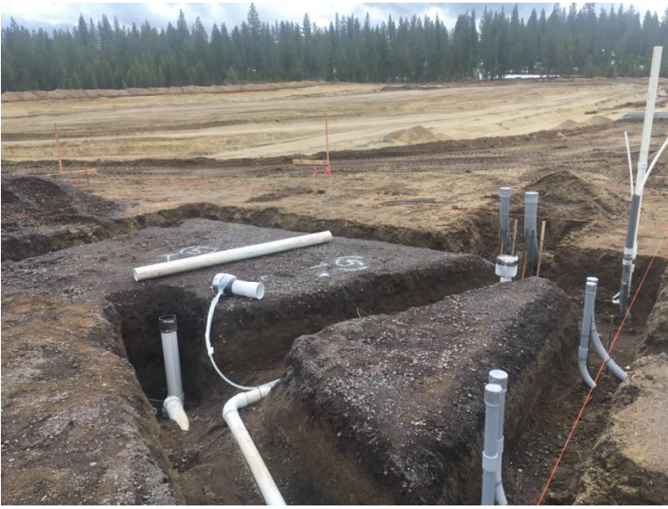
Figure 3: Looking southeast at the dug out foundation pad for the chlorination building with preinstalled conduits for sewage and electrical work.