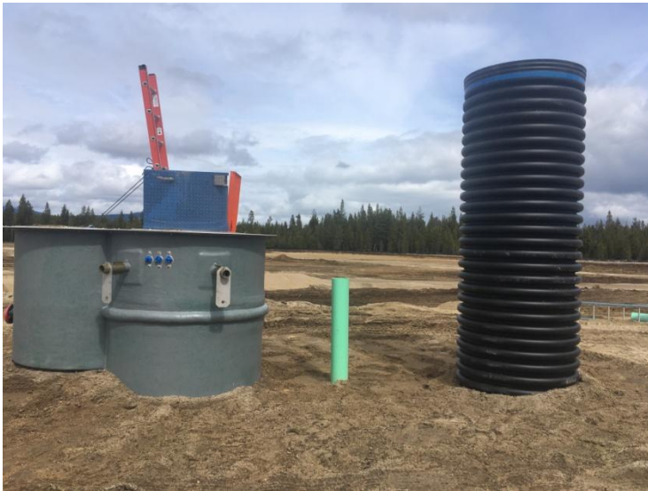
Figure 1: Looking north at the installed lift station adjacent one of the chlorinator's risers.