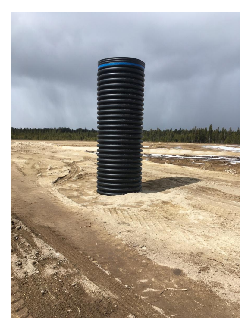
Figure 3: Looking northwest at one of the risers seated on the chlorinator.