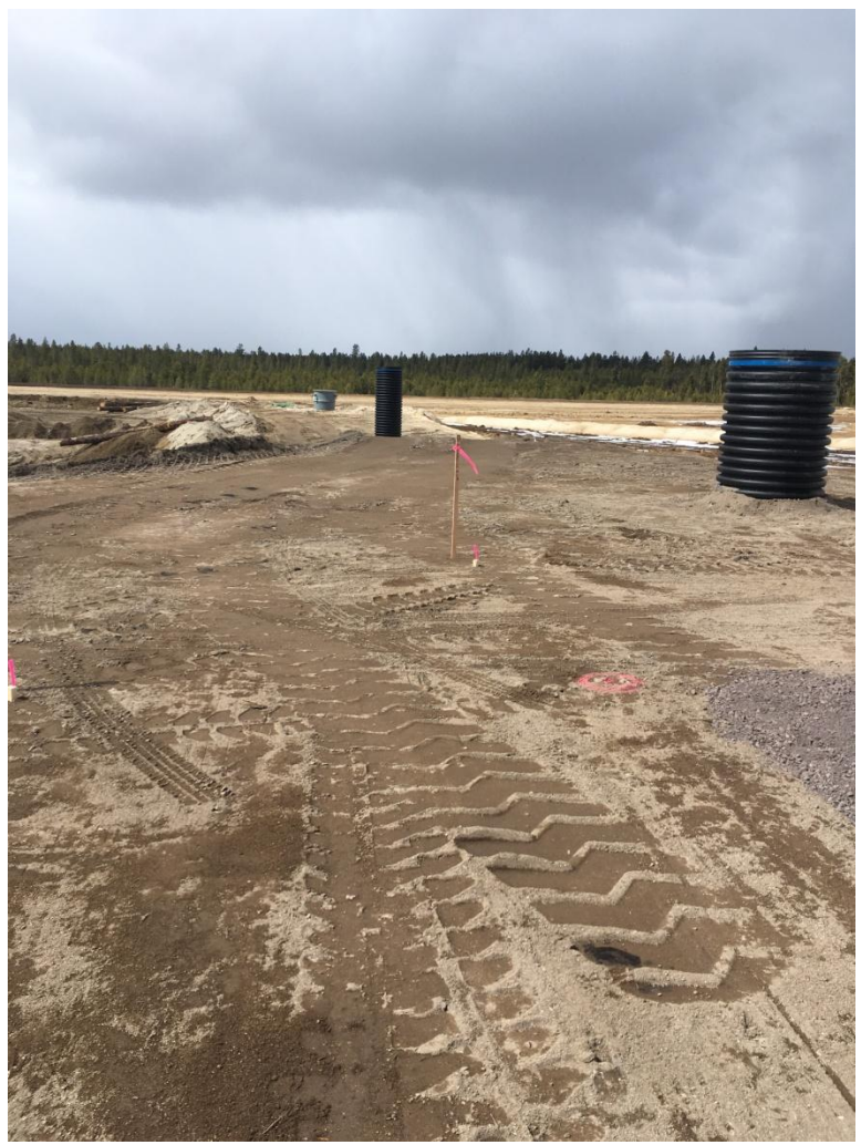
Figure 2: Looking west at the new soil blend used to build up the berm. Note the lack of tire treads. Note the risers in the background and the lift station in the far back center of the picture.