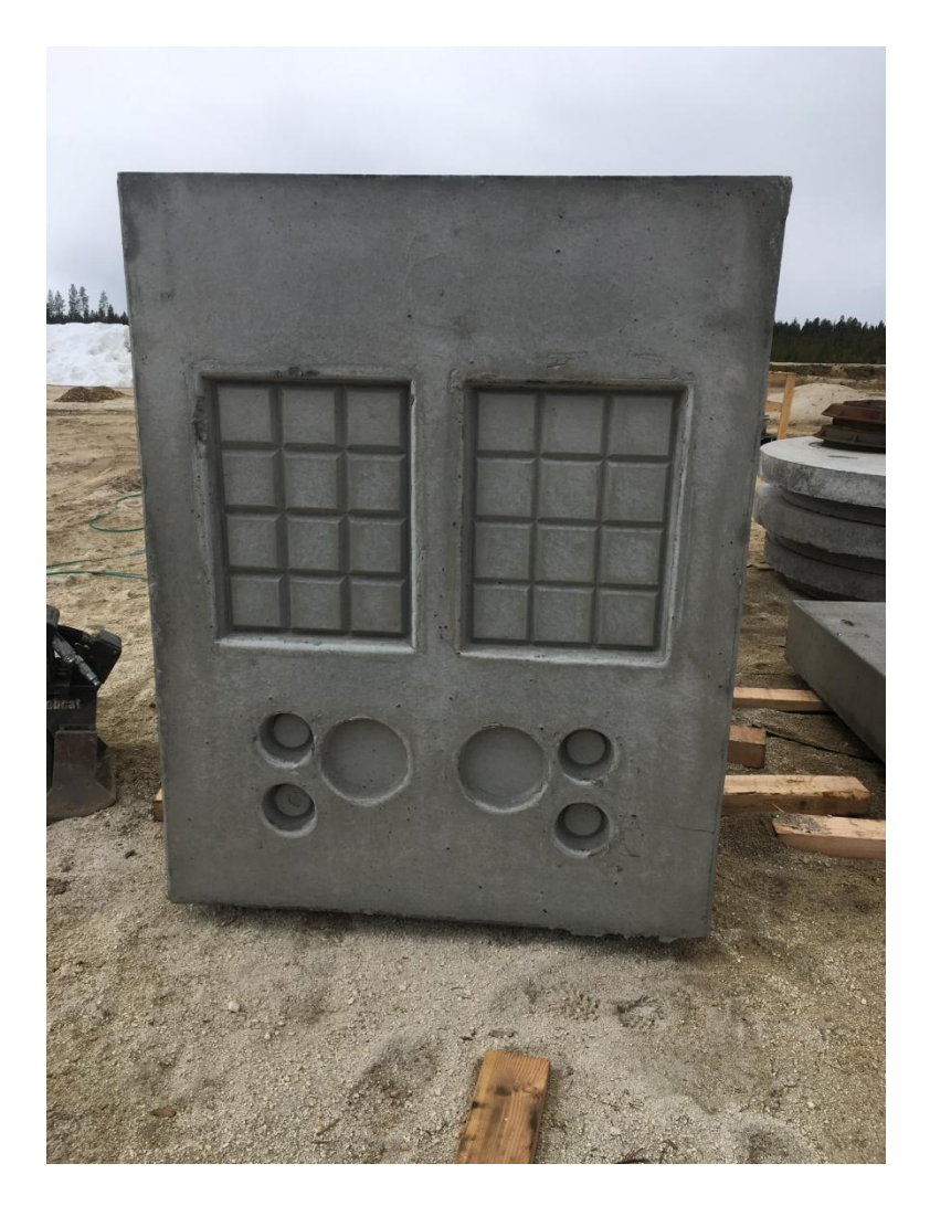
Figure 8: Materials on site.