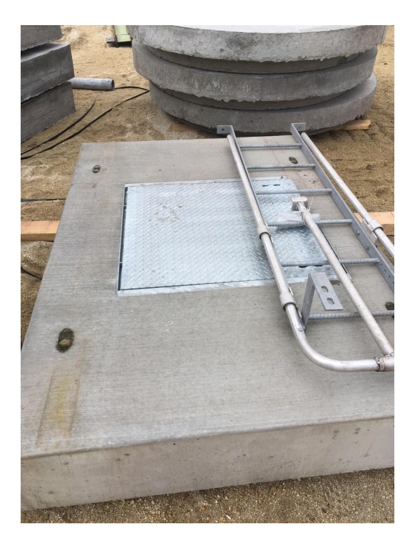
Figure 7: Materials on site.