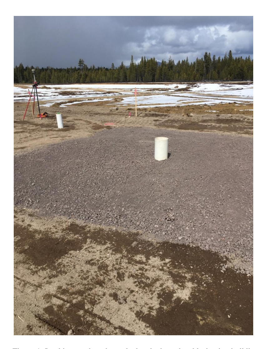
Figure 1: Looking north at the rocked pad where the chlorination building will sit. Notice the two pipe opening set up and awaiting connection to the system.