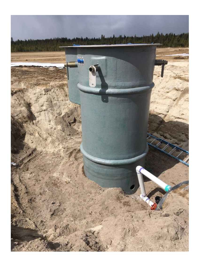
Figure 4: Looking northwest at the installed lift station.